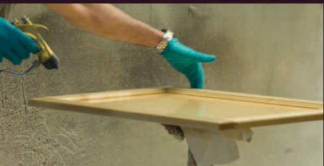
Custom applications on Phase II Door