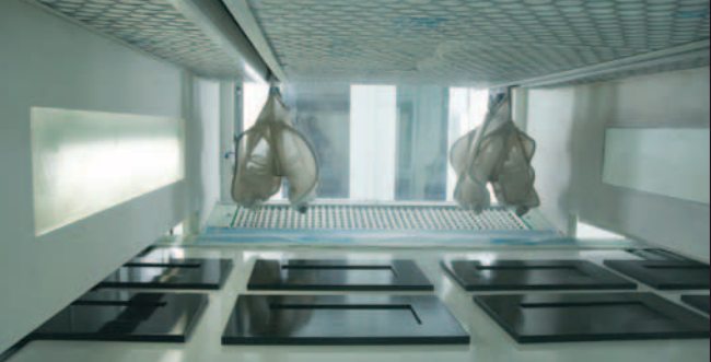
Computer controlled paint application on Softouch Doors