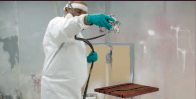
Ice finish being applied to a Fullwrap door