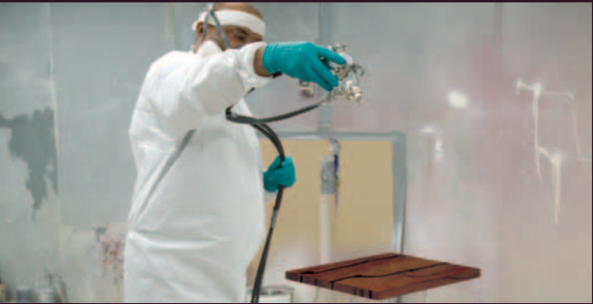
Ice finish being applied to a Fullwrap door